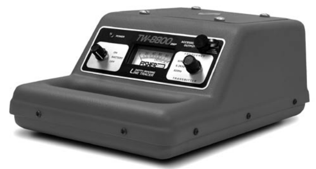
The TW-8800 Transmitter.

WARNING: Do not connect output leads to a live (energized) utility. Please prevent shock hazard and equipment damage.